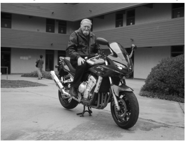
Clive Granger, Nobel Laureate, UCSD

Clive Granger's great breakthroughs showed that traditional statistical methods could be misleading if applied to variables that tend to wander over time without returning to some long-run resting point. He demonstrated that many variables display long-run patterns that can be exploited in statistical analysis. Granger's discovery of cointegration (mathematical structure of time series data) not only led to significant breakthroughs in statistics and macroeconomic forecasting,